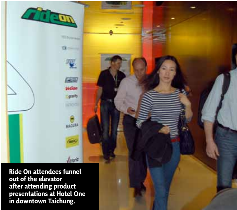
Ride On attendees funnel out of the elevator after attending product presentations at Hotel One in downtown Taichung.