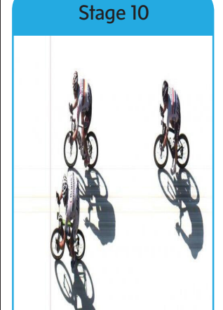
Source: Le Tour de France (@letour) The pirate @marcelkittel! Retweet for him #TDF pic.twitter.com/yqFVS1dRyo" 9 July 2013, 8:56 AM. Tweet.