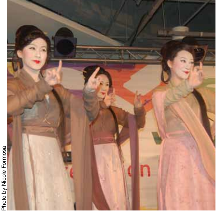
Traditional Chinese dancers perform at Tuesday night's annual Velo, Wellgo and Prologo appreciation party kicking off the show. Turn to page 5 for more photos.

On Tuesday afternoon, the Nangang Exhibition Hall in Taipei bustled with activity as local workers hammered together booths, hanging company logos, painting walls and setting up product displays in preparation for the 23rd annual Taipei Cycle's Wednesday opening.